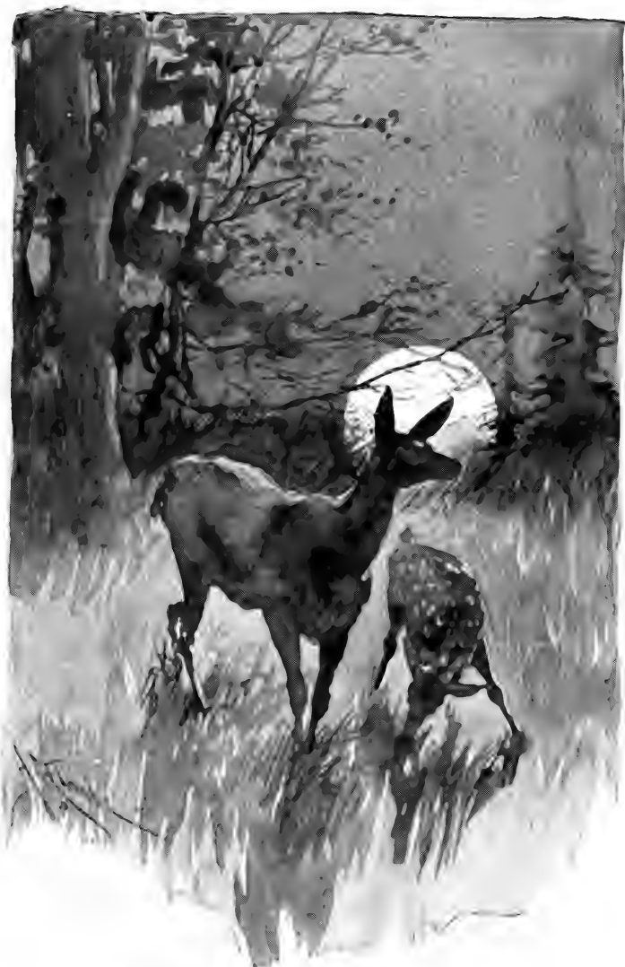
"BESIDE THE SILVER-FOOTED DEER THERE GRAZED A SPOTTED FAWN.—Page 209.